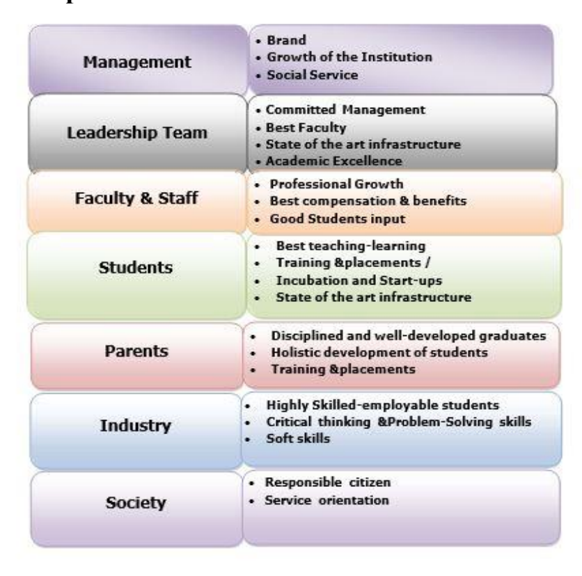
Fig: 10.1.2.2 Expectations of Stake holders